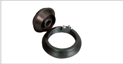
4030486 – Light-truck wheel kit To clamp light-truck wheels