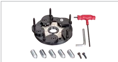
4030515 – Closed centre rim kit To clamp closed centre rims, including compact clamping device