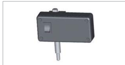
4030849 – Laser pointer To facilitate correct positioning of the mounting head