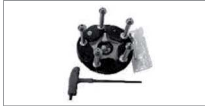
4031245 – Reverse mounting kit To clamp reverse mounted wheels